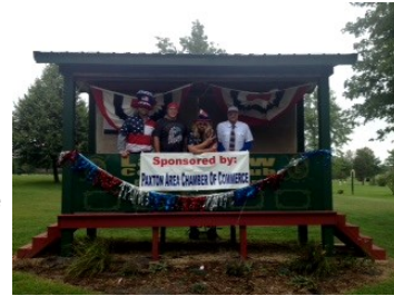
2nd Place Team: Paxton Hardware & Rental