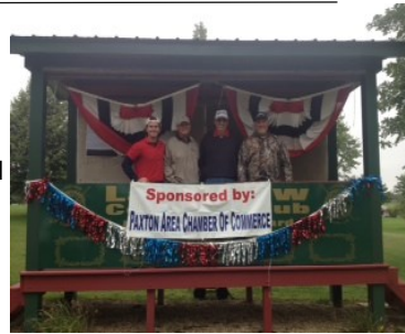
1st Place Team: Ameren